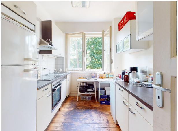
Küche 1. OG rechts