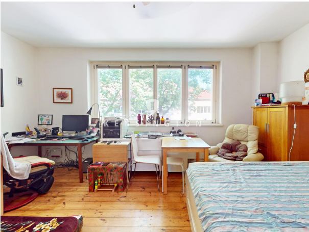
Wohnzimmer 1. OG rechts