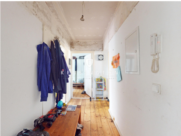
Flur 1. OG rechts