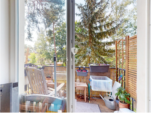
Balkon 1. OG rechts