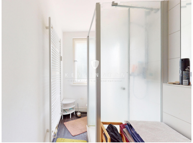
Duschbad 1. OG rechts