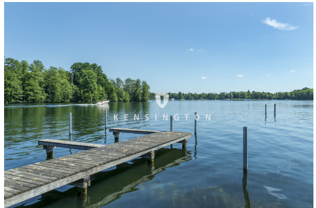
Blick auf Steg