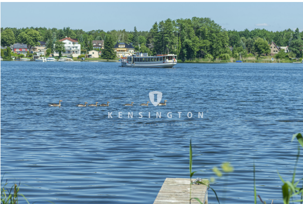
Blick vom Steg