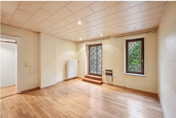
Kinderzimmer im 1. OG