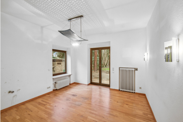
Zimmer im EG