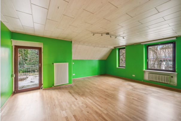
Schlafzimmer im 1. OG