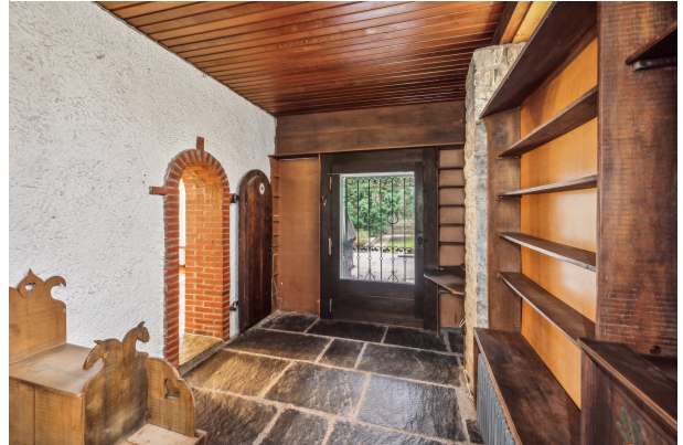
Büro im EG