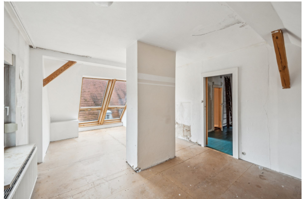
Zimmer im DG