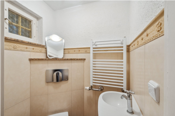
Gäste-WC im EG