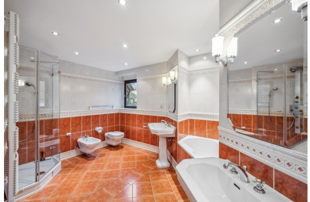
Bad im 1. OG