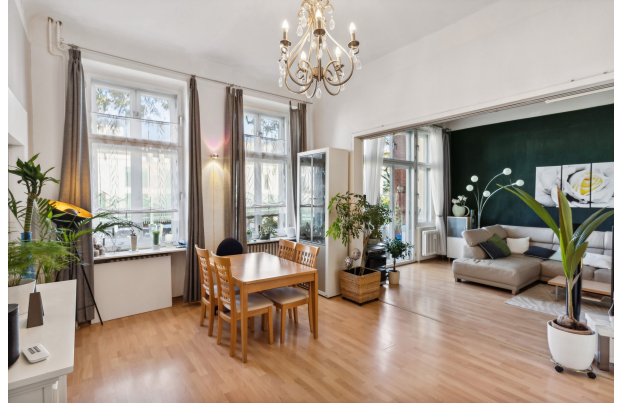
Esszimmer, daneben das Wohnzimmer