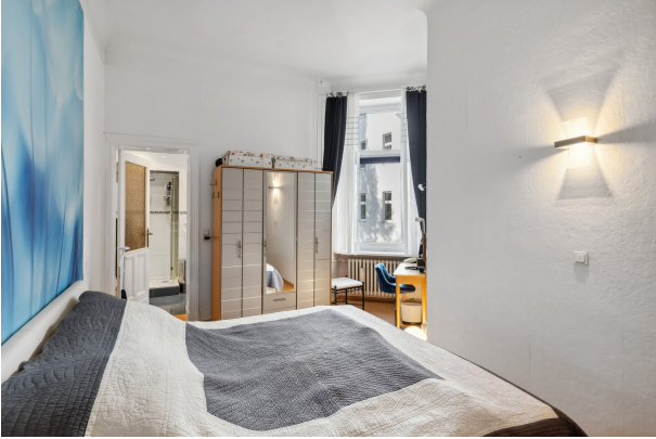
Schlafzimmer zum Innenhof