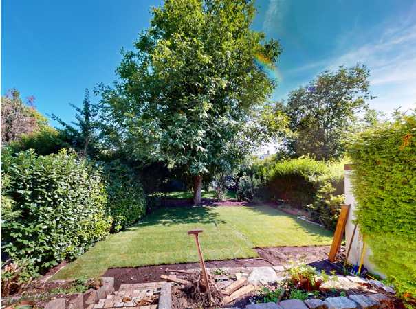
Blick in den Garten