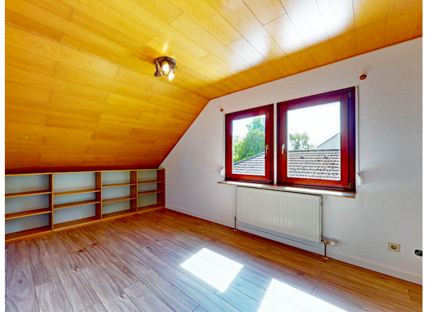
Zimmer 1 OG