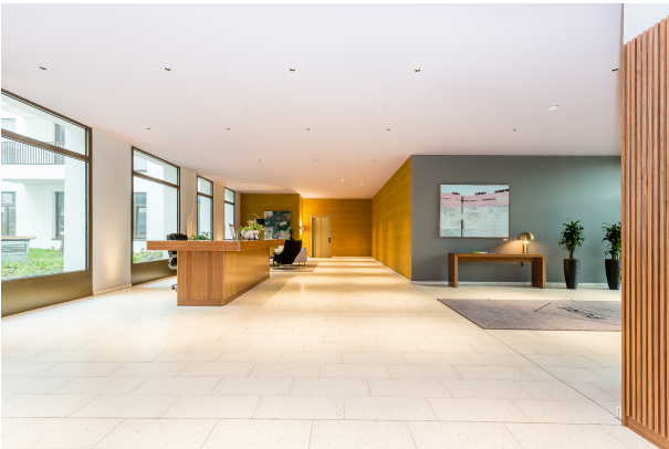
Empfangshalle mit Concierge-Service