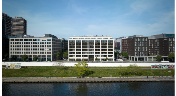
PURE-Living in Traumlage von Berlin