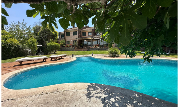
Imagen de WhatsApp 2024-10-17 a las 11.13.19_d6ba5310