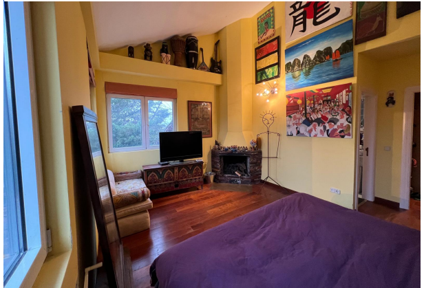
13 Imagen de WhatsApp 2024-10-17 a las 11.07.44_4ed26d00