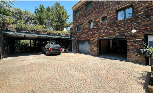
Imagen de WhatsApp 2024-10-17 a las 11.13.09_e0db2095