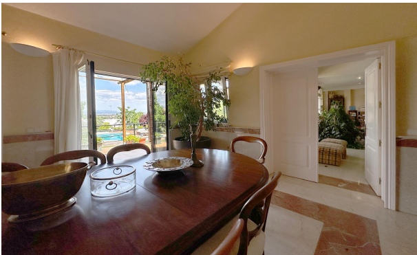
17 Imagen de WhatsApp 2024-10-17 a las 11.13.11_fcdd3647