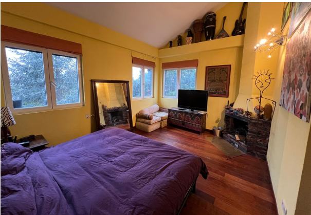
Imagen de WhatsApp 2024-10-17 a las 11.13.20_b42a22ea