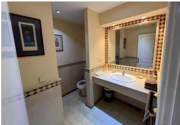
15 Imagen de WhatsApp 2024-10-17 a las 11.13.11_3384eeb8