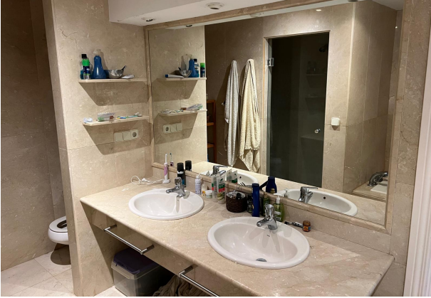
Imagen de WhatsApp 2024-10-17 a las 11.13.19_344114f6