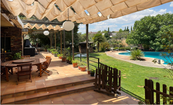
Imagen de WhatsApp 2024-10-17 a las 11.13.18_d4154509