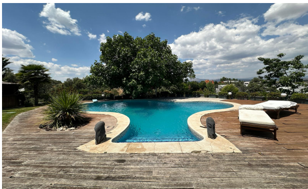
18 Imagen de WhatsApp 2024-10-17 a las 11.13.12_0c9c49c4