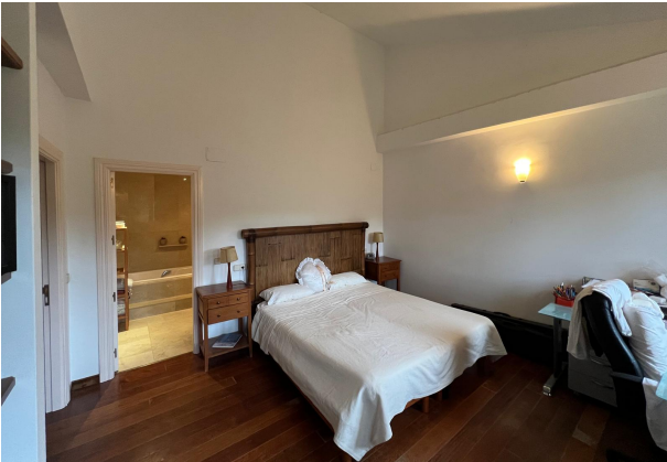
12 imagen de WhatsApp 2024-10-17 a las 11.07.44_3e301862