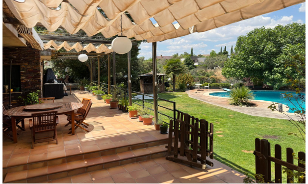
11 Imagen de WhatsApp 2024-10-17 a las 11.07.43_216d89e3