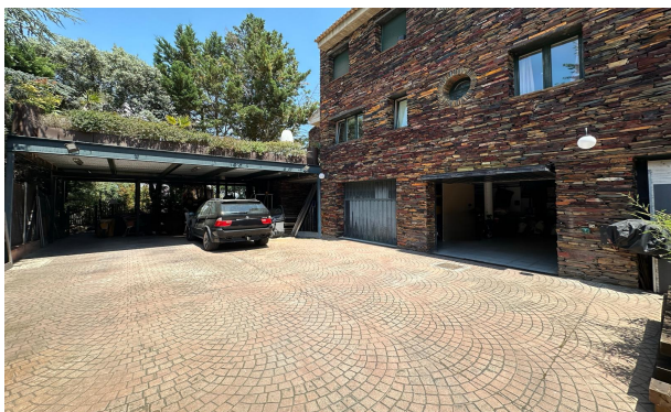
Imagen de WhatsApp 2024-10-17 a las 11.13.09_e0db2095