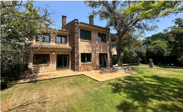
Imagen de WhatsApp 2024-10-17 a las 11.13.16_ac82748c