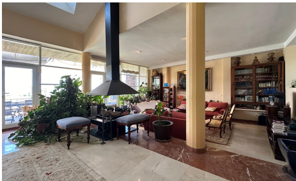
20 Imagen de WhatsApp 2024-10-17 a las 11.13.13_0eab0fc1