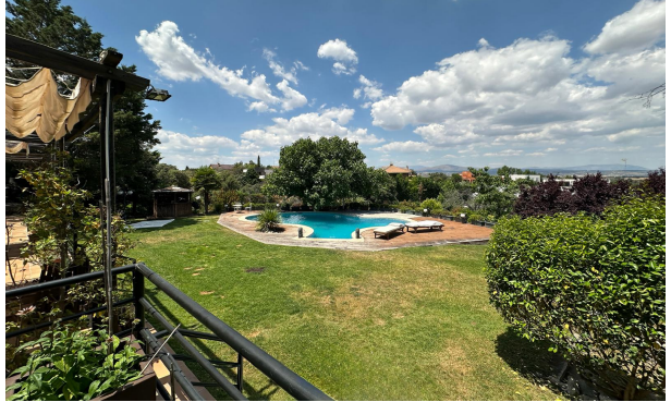
Imagen de WhatsApp 2024-10-17 a las 11.13.18_127da4ff