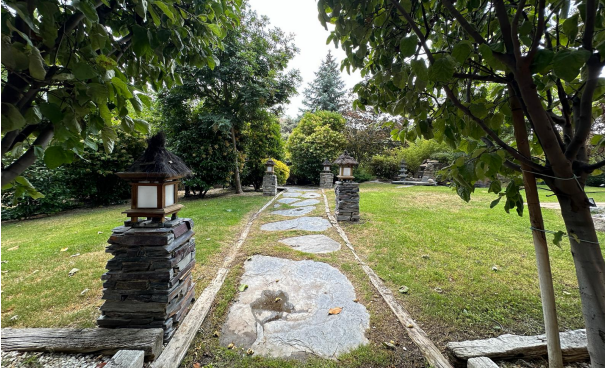
Imagen de WhatsApp 2024-10-17 a las 11.13.14_8885978e