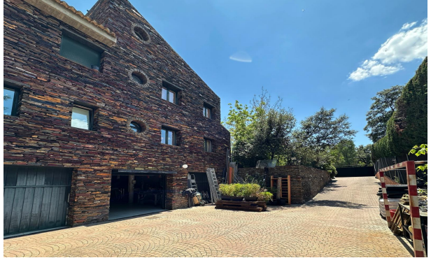
Imagen de WhatsApp 2024-10-17 a las 11.13.14_fe83e34f