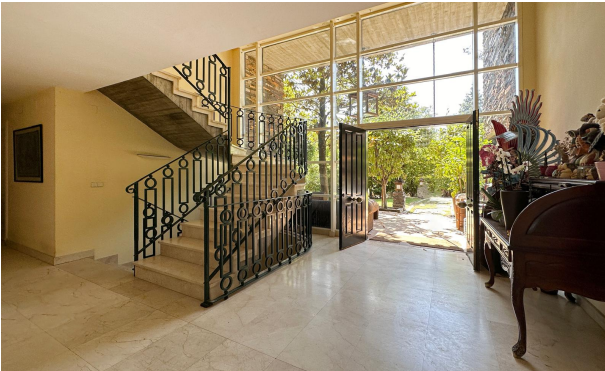
7 Imagen de WhatsApp 2024-10-17 a las 11.13.13_26727103