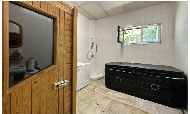
Imagen de WhatsApp 2024-10-17 a las 11.13.13_944e9ac0