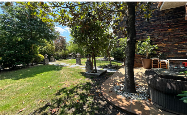
Imagen de WhatsApp 2024-10-17 a las 11.13.17_c7edede3