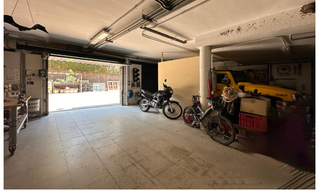
21 Imagen de WhatsApp 2024-10-17 a las 11.13.13_fe2dce30