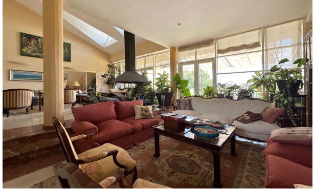
6 Imagen de WhatsApp 2024-10-17 a las 11.13.10_1c410b96