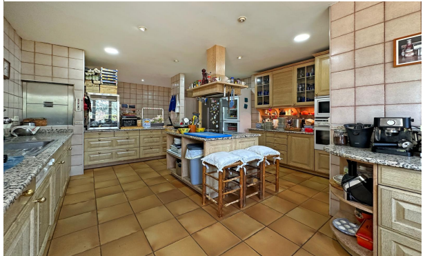
8 Imagen de WhatsApp 2024-10-17 a las 11.13.16_e5f87021