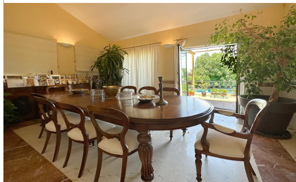
Imagen de WhatsApp 2024-10-17 a las 11.13.20_c2879017