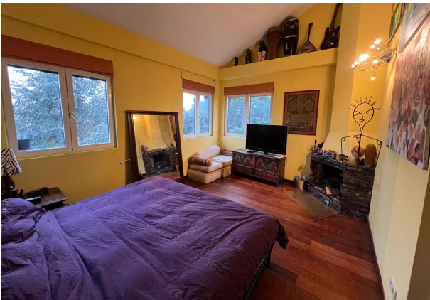
Imagen de WhatsApp 2024-10-17 a las 11.13.20_b42a22ea