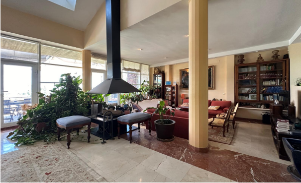
20 Imagen de WhatsApp 2024-10-17 a las 11.13.13_0eab0fc1