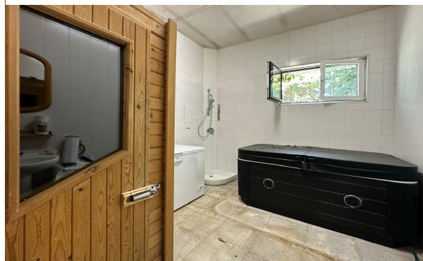
Imagen de WhatsApp 2024-10-17 a las 11.13.13_944e9ac0