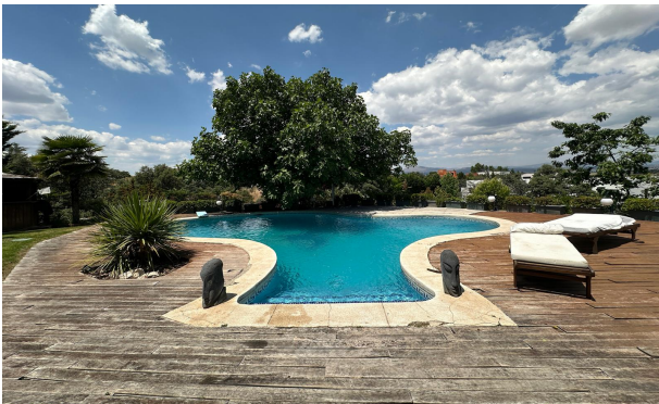
18 Imagen de WhatsApp 2024-10-17 a las 11.13.12_0c9c49c4