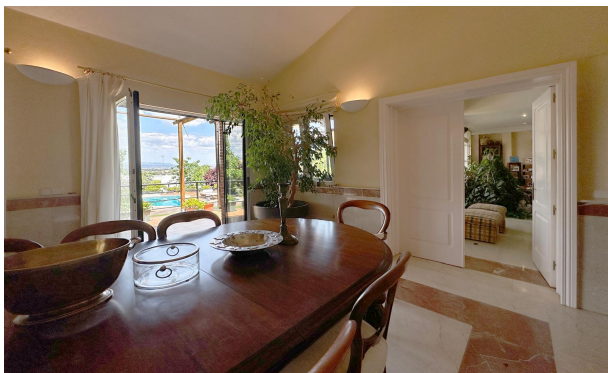
17 Imagen de WhatsApp 2024-10-17 a las 11.13.11_fcdd3647