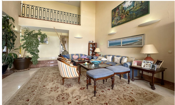
16 Imagen de WhatsApp 2024-10-17 a las 11.13.11_e8777f25