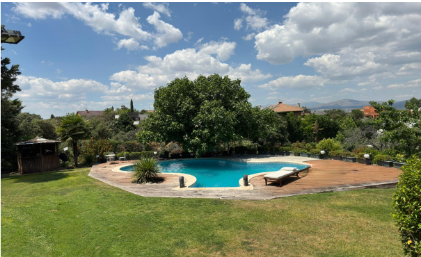
Imagen de WhatsApp 2024-10-17 a las 11.13.20_83fc19a7