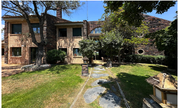
Imagen de WhatsApp 2024-10-17 a las 11.13.17_69ff8871