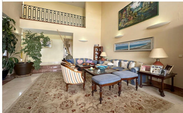
16 Imagen de WhatsApp 2024-10-17 a las 11.13.11_e8777f25