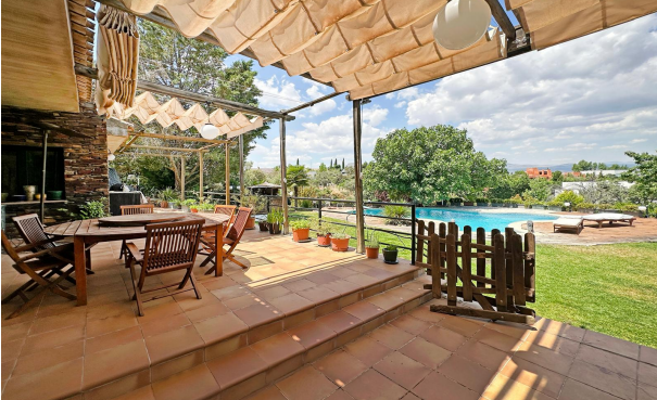
1 Imagen de WhatsApp 2024-10-17 a las 11.13.19_71d7818e