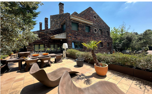
3 Imagen de WhatsApp 2024-10-17 a las 11.13.09_1e9cbd82