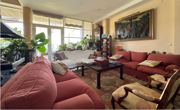
5 Imagen de WhatsApp 2024-10-17 a las 11.13.11_9a47fd17