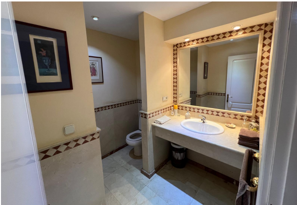
15 Imagen de WhatsApp 2024-10-17 a las 11.13.11_3384eeb8