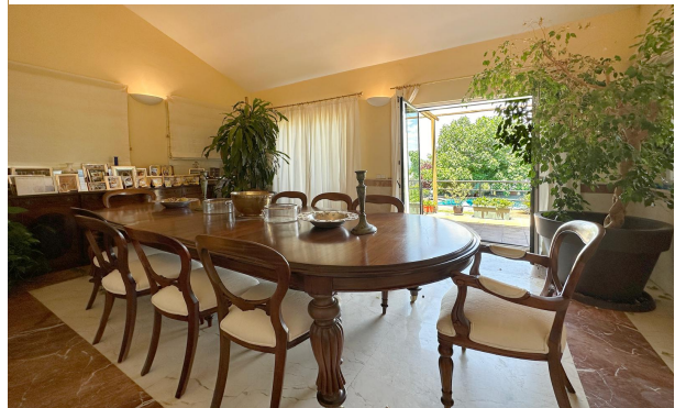
Imagen de WhatsApp 2024-10-17 a las 11.13.20_c2879017