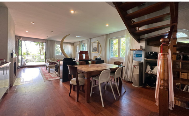
9 Imagen de WhatsApp 2024-10-17 a las 11.07.42_1a72f774