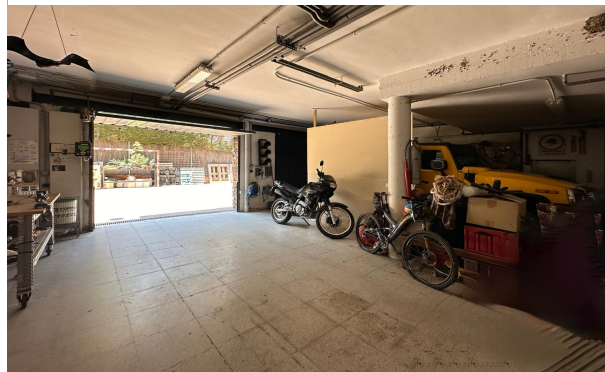
21 Imagen de WhatsApp 2024-10-17 a las 11.13.13_fe2dce30