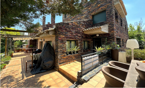
Imagen de WhatsApp 2024-10-17 a las 11.13.18_8c45a570