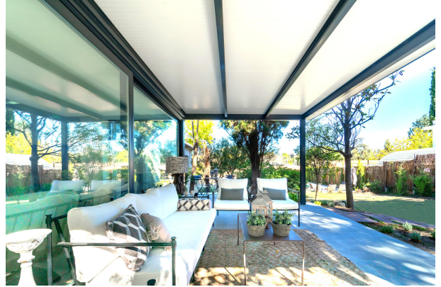
PB (7) 02