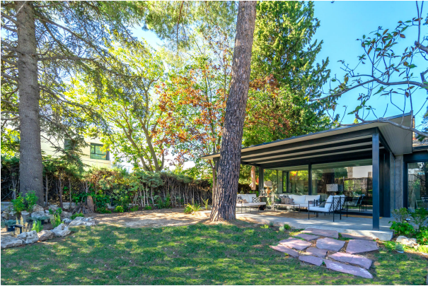
PB (4) 02