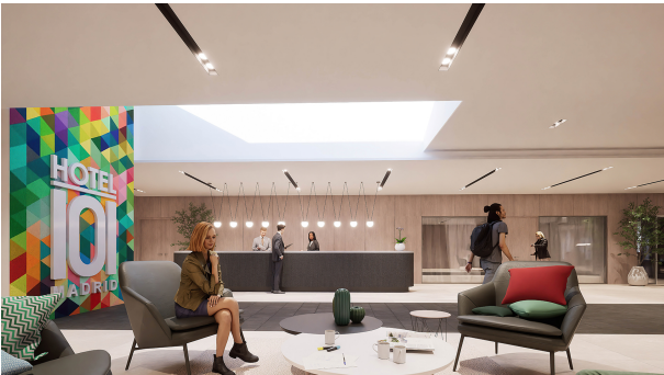
H101-Madrid Lobby v3 02