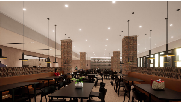
H101-Madrid Restaurant Comedor v2 02