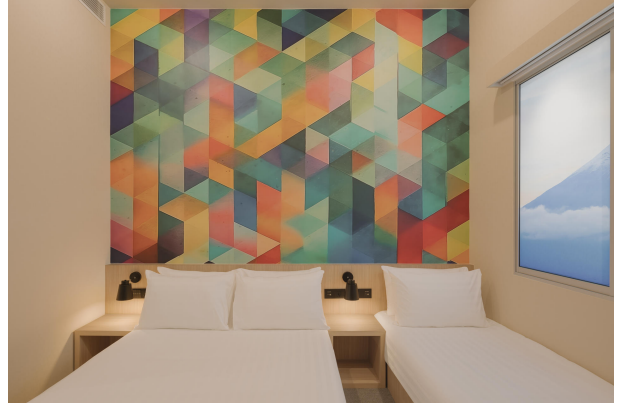
Hotel101 Showroom (Bedroom, v3)