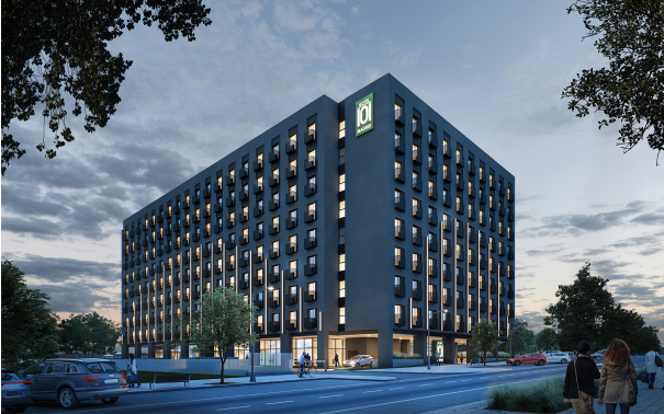
H101-Madrid Exterior Facade (Night) v2