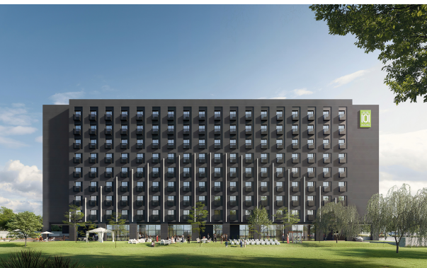
H101-Madrid Exterior Facade v2 02