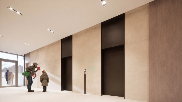
H101-Madrid Lobby v7 02