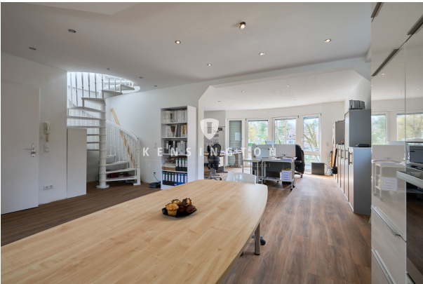
Blick in den Wohnbereich