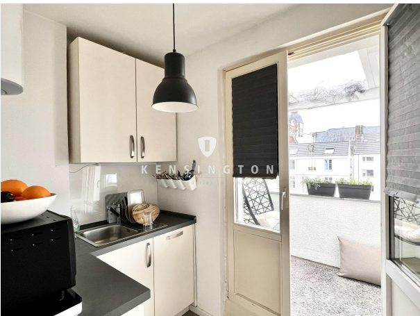
Küche - 4. OG