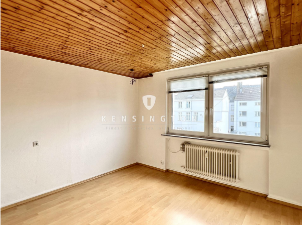
Schlafzimmer - 3. OG