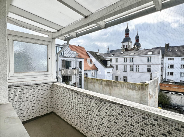
Balkon - 3. OG