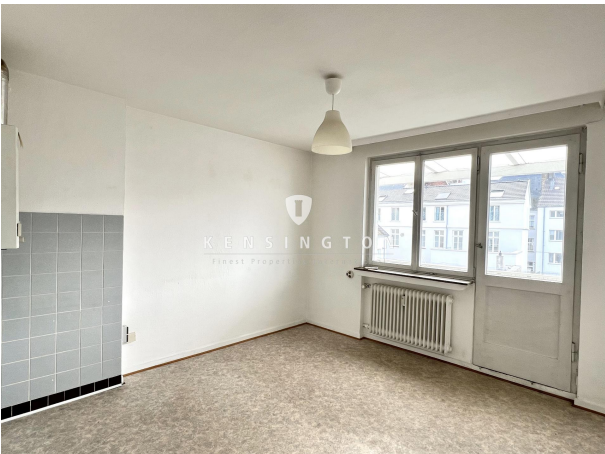
Wohnküche - 3. OG