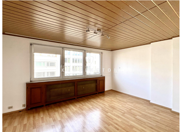
Wohnzimmer - 3. OG