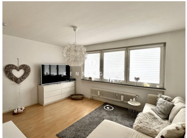
Wohnzimmer - 4. OG