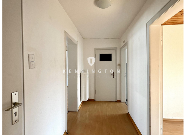
Diele - 3. OG