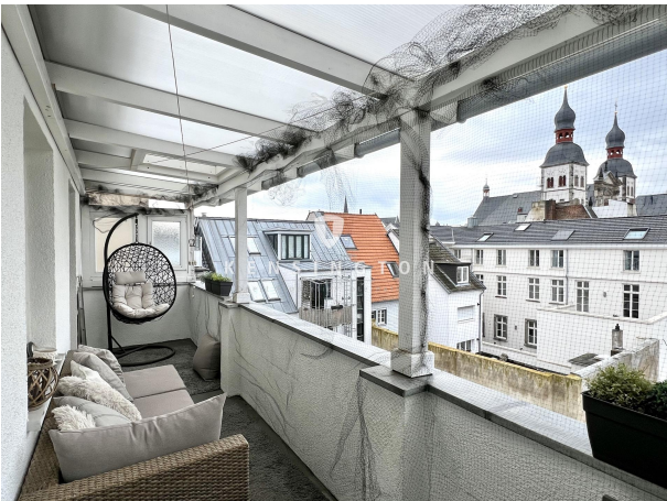
Balkon - 4. OG