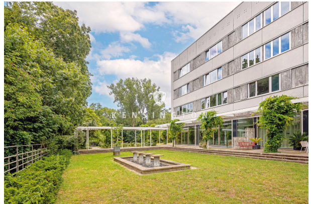
Außenansicht - Garten