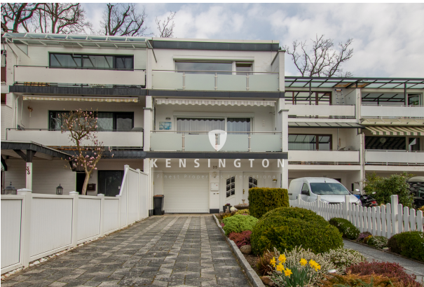
*Einfahrt 2_KBR_172_Reihenmittelhaus in Seevetal