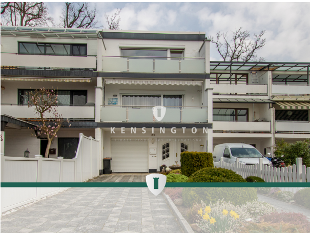
**Titelbild_2_KBR_172_Reihenmittelhaus in Seevetal