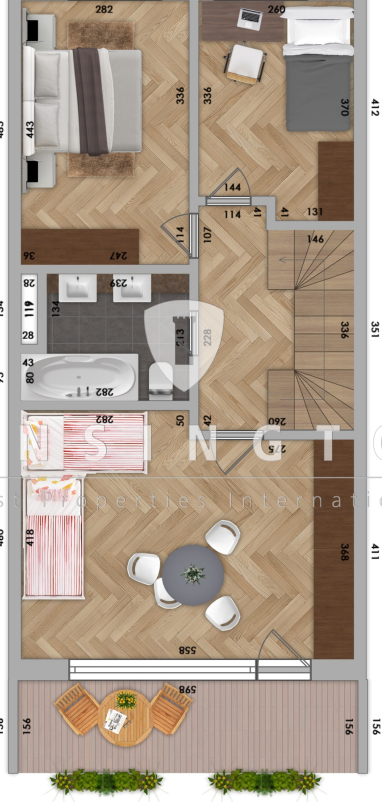
*Grundriss Obergeschoss_KBR_172_Reihenmittelhaus in Seevetal