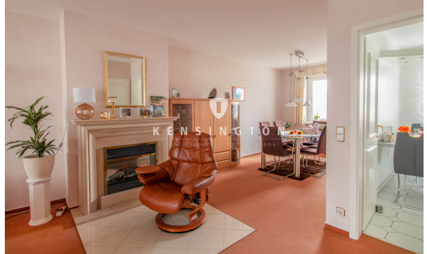
*Essbereich und Kamin_KBR_172_Reihenmittelhaus in Seevetal