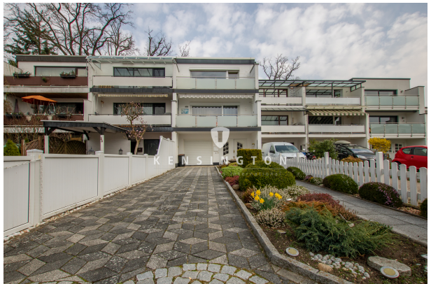
**Einfahrt_KBR_172_Reihenmittelhaus in Seevetal