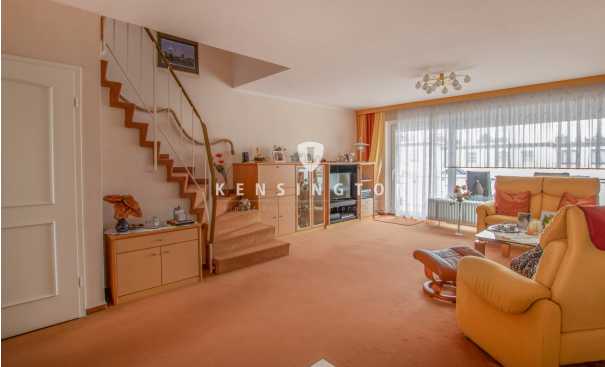
Wohnzimmer Ansicht 1_KBR_172_Reihenmittelhaus in Seevetal