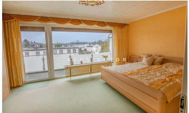
Schlafzimmer OG_KBR_172_Reihenmittelhaus in Seevetal