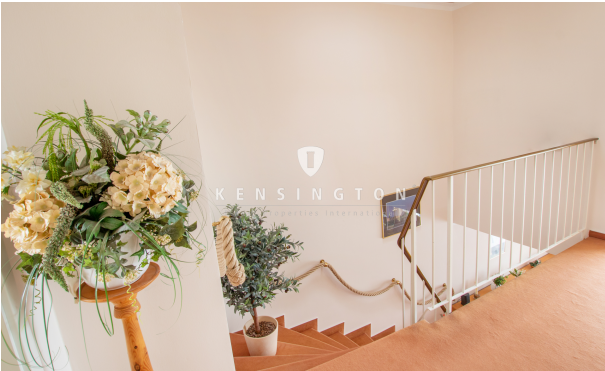
*Treppenaufgang zum OG_KBR_172_Reihenmittelhaus in Seevetal