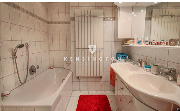
Badezimmer OG_KBR_172_Reihenmittelhaus in Seevetal