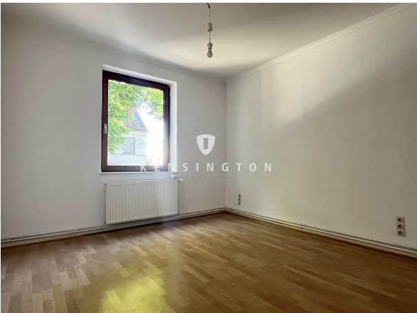
Zimmer 4 rechts_Wohnung. 1. OG