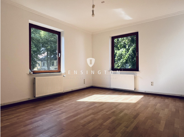
Zimmer 2 links_Wohnung. 1. OG