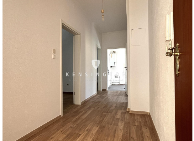
Flur_Wohnung. 1. OG