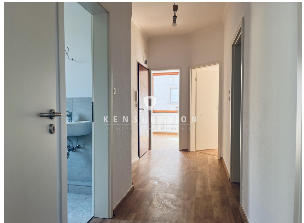
Flur_Wohnung. 1. OG