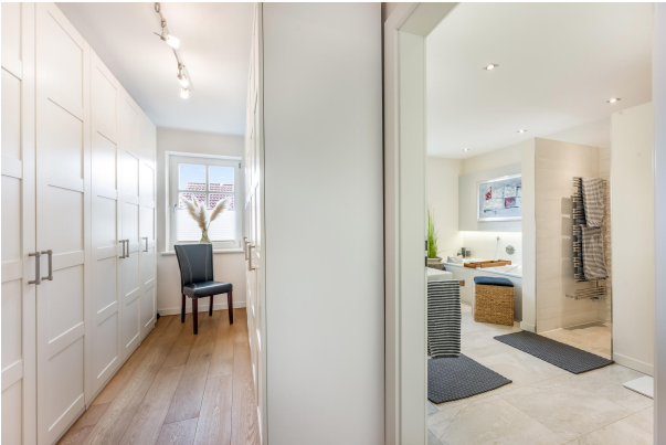
Ankleide mit Blick ins Badezimmer