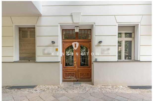
Eingangstür zum Wohnhaus