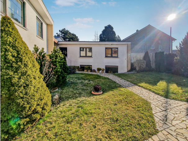
Blick auf Anbau