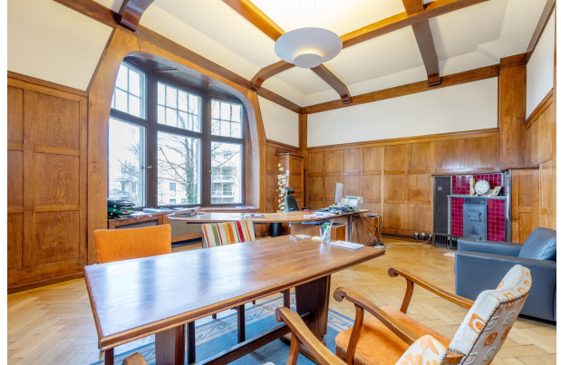
Büro / Konferenzraum Erdgeschoss