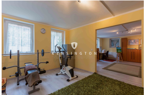
Zimmer 11 - Souterrain