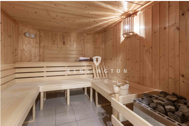
Sauna - Untergeschoss