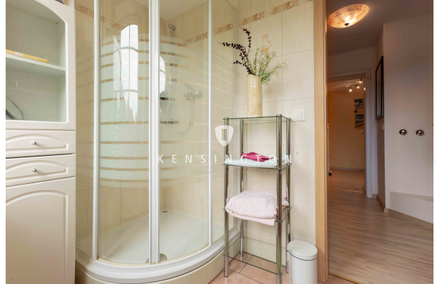
Bad 3 - 1.Dachgeschoss - Zugang 2.Dachgeschoss