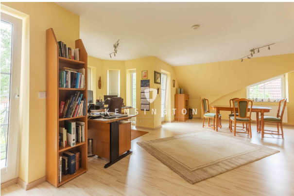
Zimmer 5 - 1.Dachgeschoss