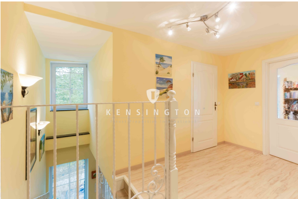
Flur 2 - 1.Dachgeschoss