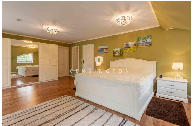
Zimmer 4 - 1.Dachgeschoss