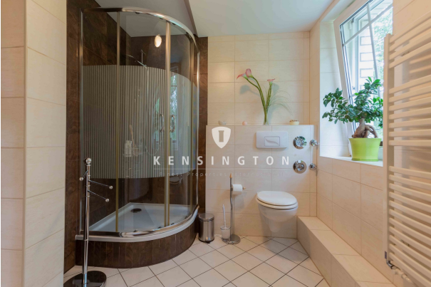
Bad 2 - 1.Dachgeschoss