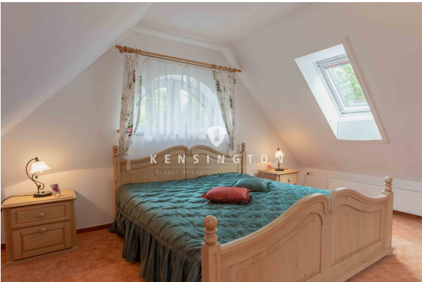
Zimmer 8 - 2.Dachgeschoss