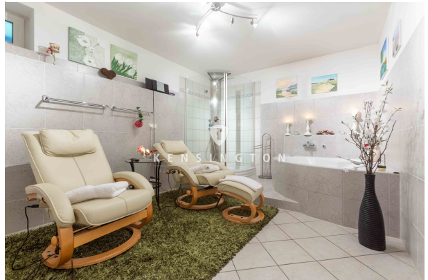
Bad 4 - Untergeschoss