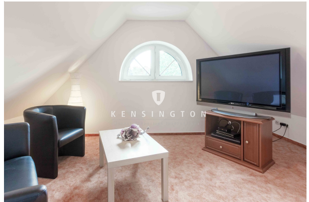
Zimmer 9 - 2.Dachgeschoss