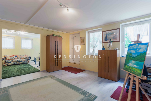
Zimmer 10 - Souterrain