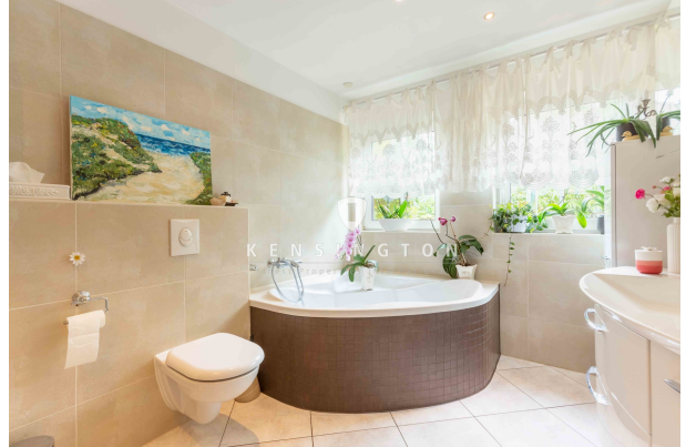
Bad 1 - Erdgeschoss