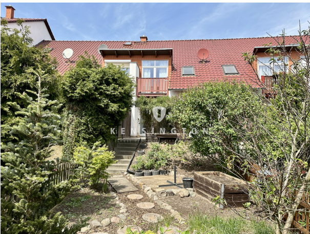
Rückseite Haus/ Garten