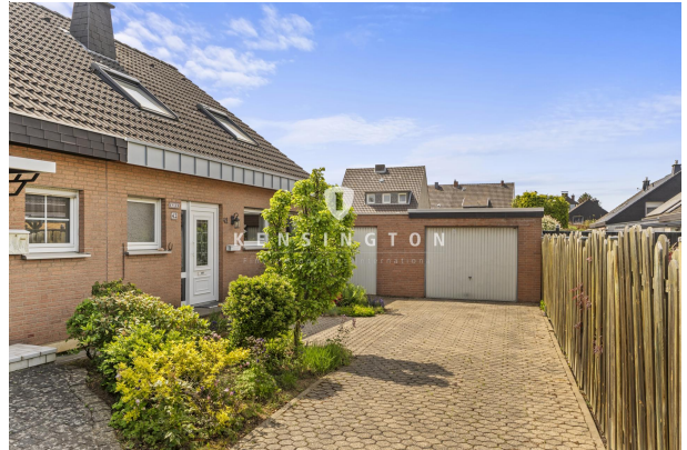
Stellplätze und Garage