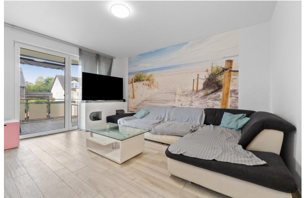
Größer 2. Balkon