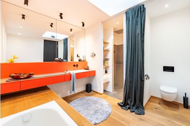
Badezimmer / Regendusche