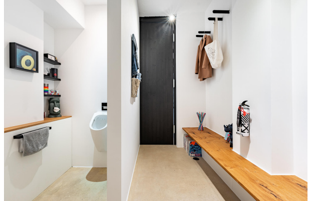
Flur / Gäste-WC