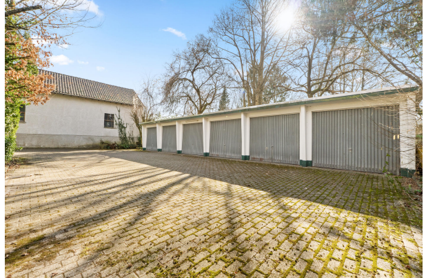
Ansicht 1 Grundstück