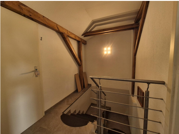
Raum für ein mögliches WC im DG