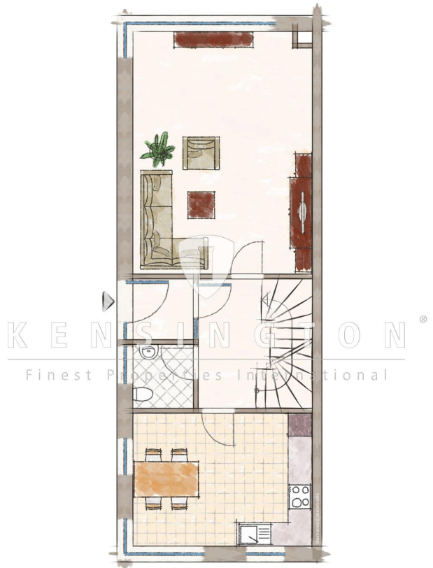
Exposéplan, nicht maßstäblich