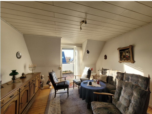
Wohnen Haus 1 DG