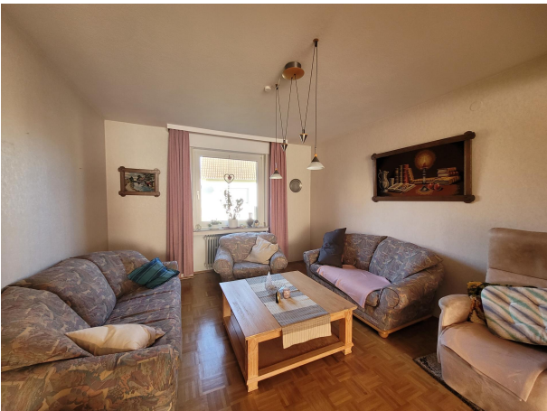
Wohnen Haus 1 EG