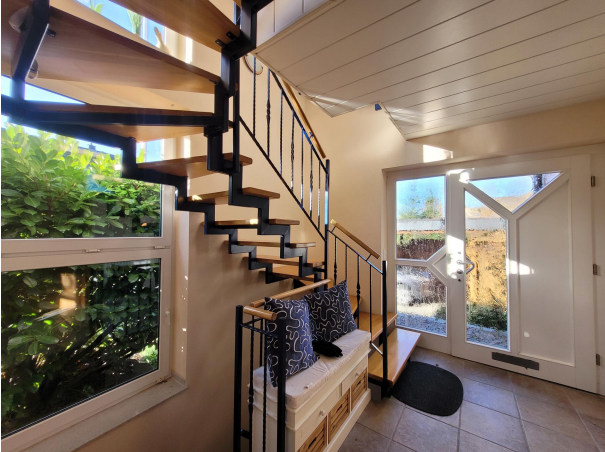
Flur Haus 2