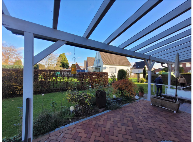
Veranda Haus 2