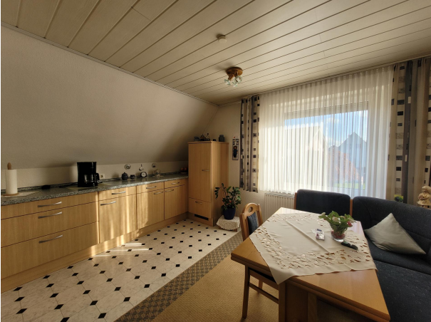
Küche Haus 1 DG