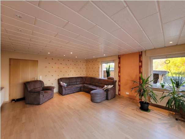
Wohnen Haus 2