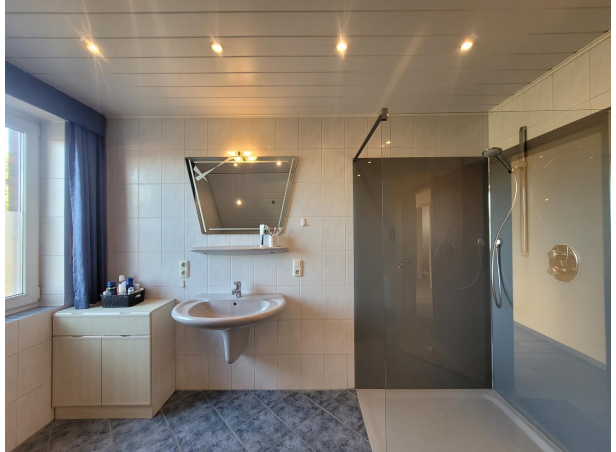
Bad Haus 2