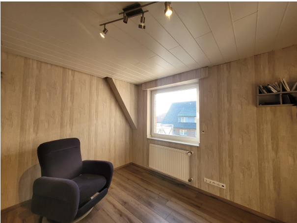
Kind Haus 2