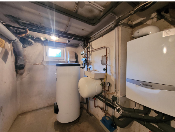
Keller Haus 1