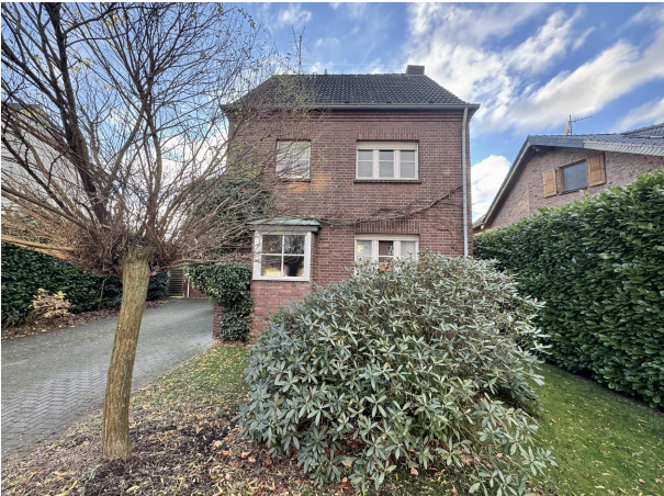
Frontansicht vom Bürgersteig