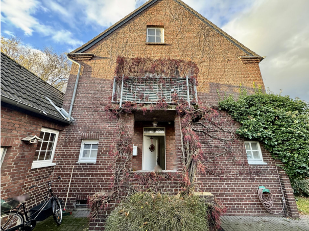
Hauseingangsbereich Giebel links