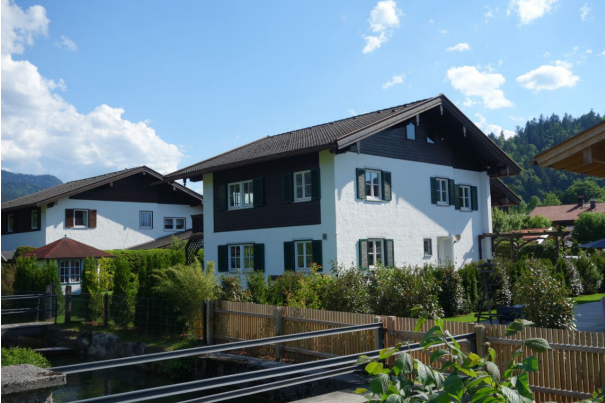
Außenansicht mit Bachlauf