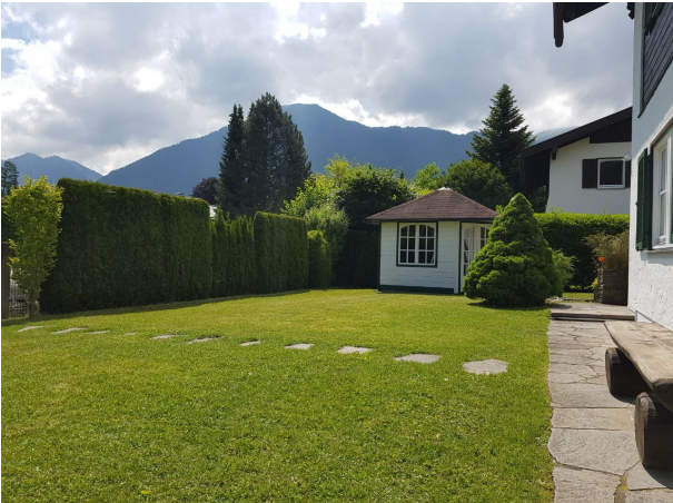
Garten mit Blick Richtung Süden