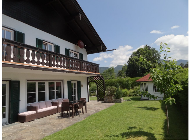
Außenansicht mit Terrasse