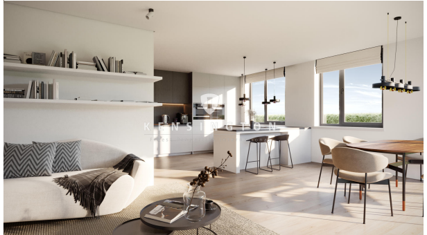
Wohnung Nr. 4