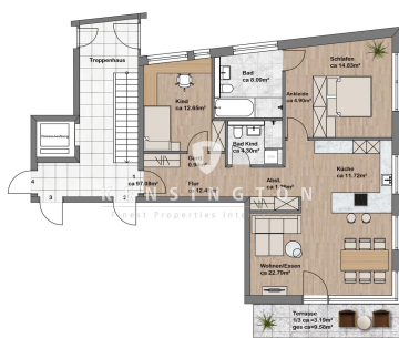
Wohnung Nr.1 Erdgeschoss/ ca. 97.08m 2