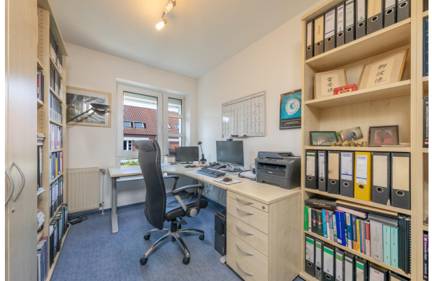
Zimmer 2 von 5