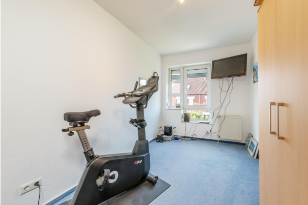
Zimmer 1 von 5