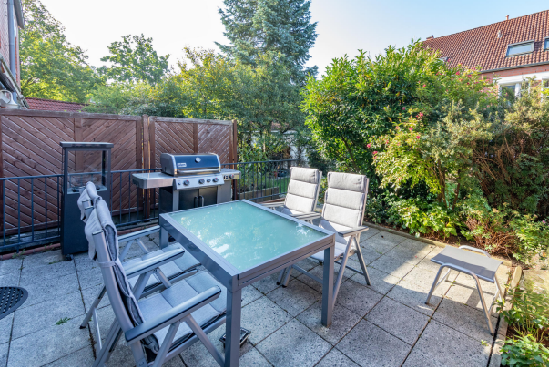
Terrasse s/w Ausrichtung