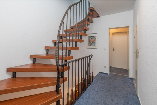
Flur 1. Obergeschoss