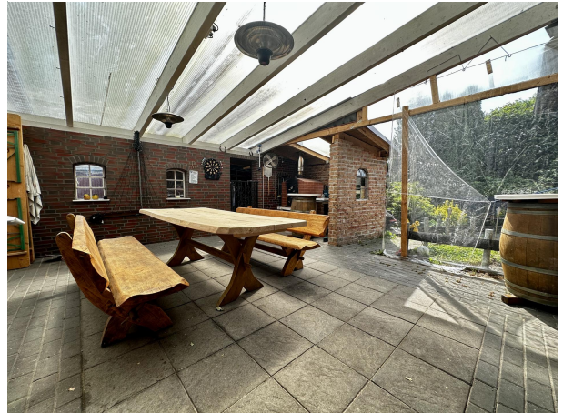
Überdachte Terrasse Haupthaus