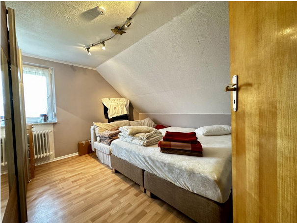
Zimmer OG ELW