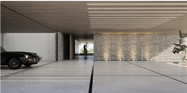
03_GARAGE - KIDS ROOM