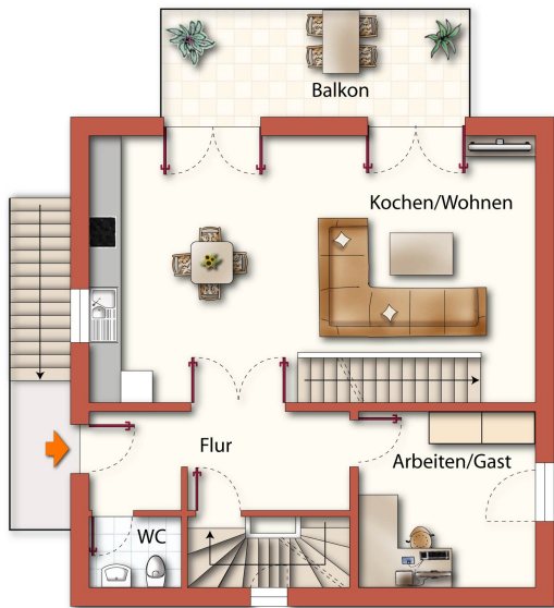
Erdgeschoss (unverbindl. Illustration)