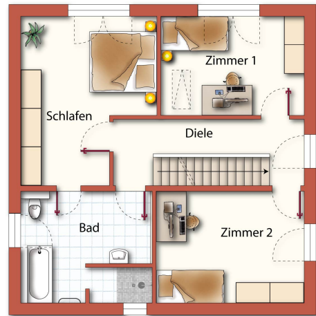
Dachgeschoss (unverbindl. Illustration)