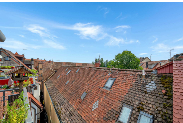
1. DG (unverbindliche Illustration)