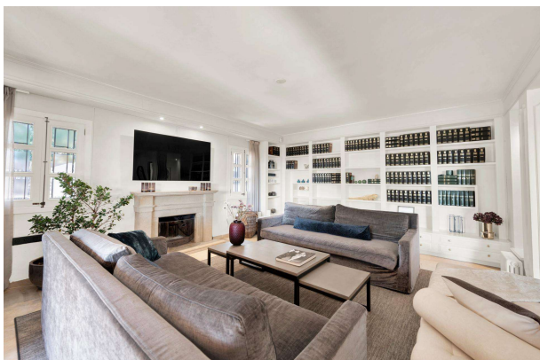
Sala de estar luminosa