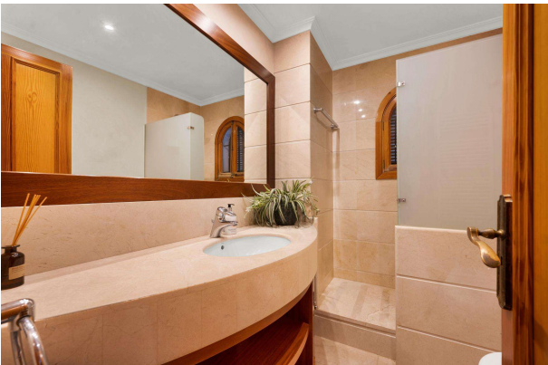
Offenes und helles Badezimmer