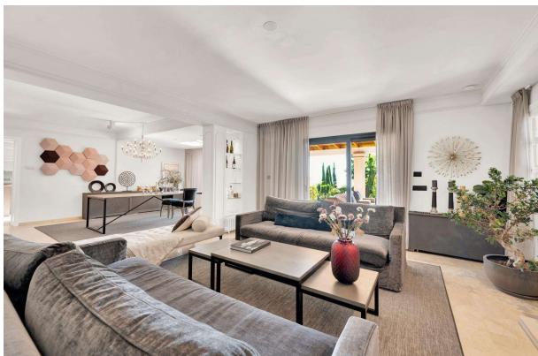
Sala de estar de diseño moderno