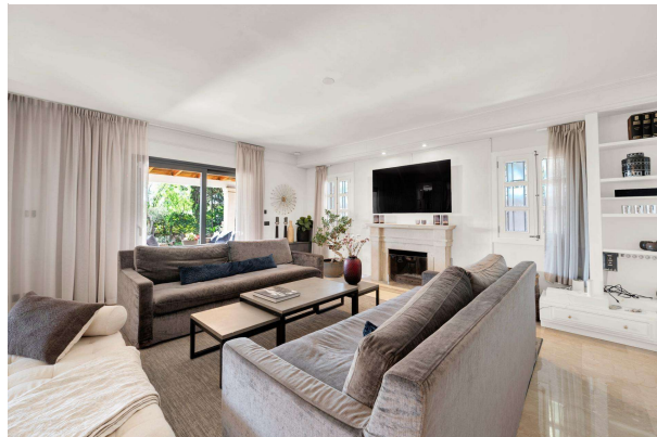
Sala de estar acogedora