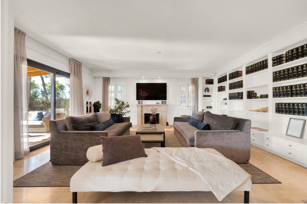
Cozy living room