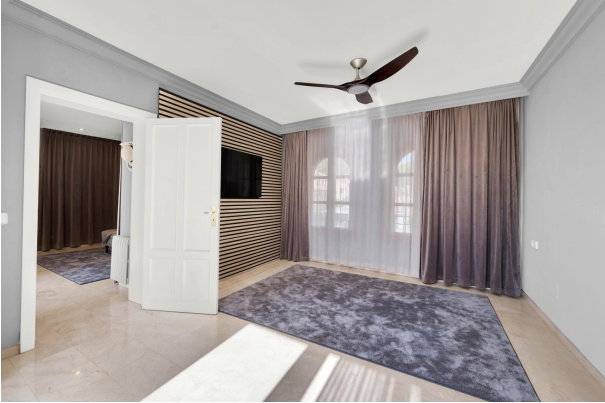
Light flooded bedroom