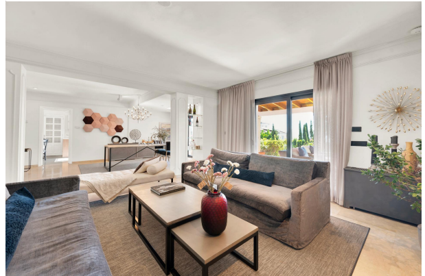
Modern designer living room