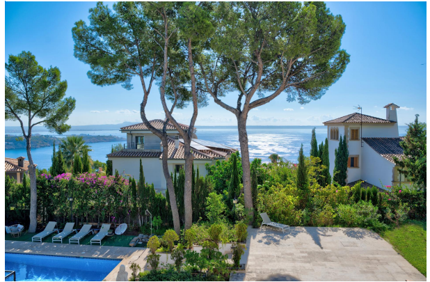
Pool with beautiful Sea views