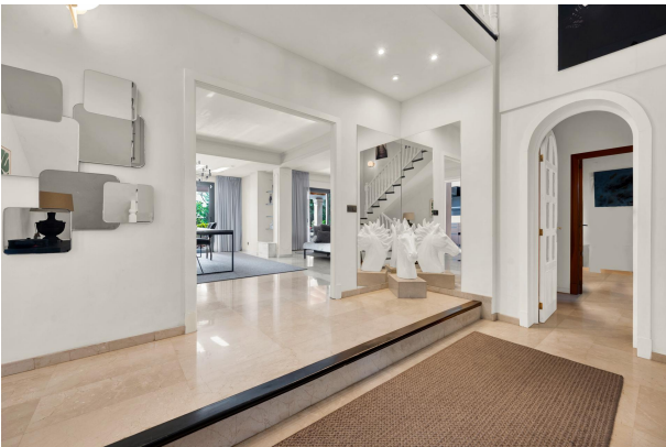
Beautiful dining area