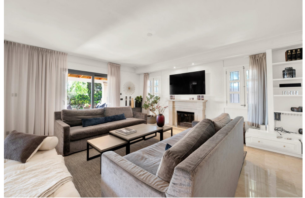
Bright living room