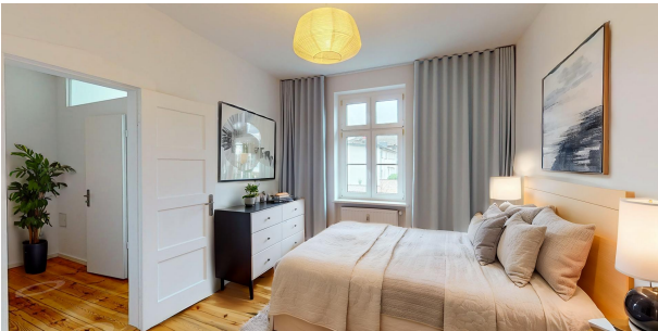
Beispieleinrichtung Zimmer I Obergeschoss