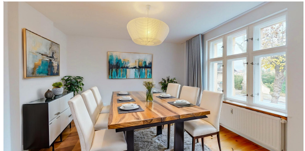
Beispieleinrichtung Zimmer III Erdgeschoss