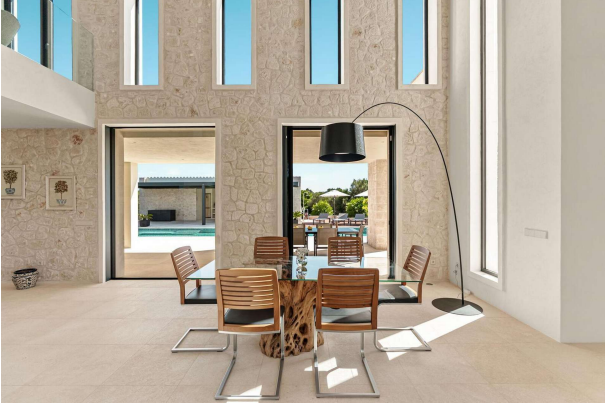
WhatsApp Image 2025-07-17 at 12.41.42 (5)