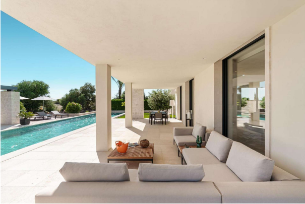
WhatsApp Image 2025-07-17 at 12.41.42 (3)