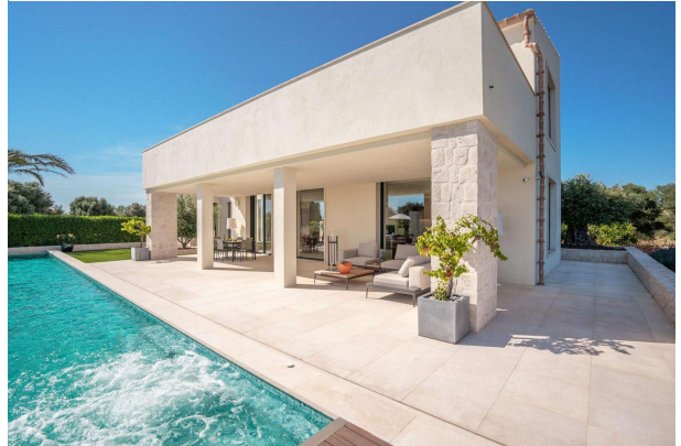
WhatsApp Image 2025-07-17 at 12.41.42