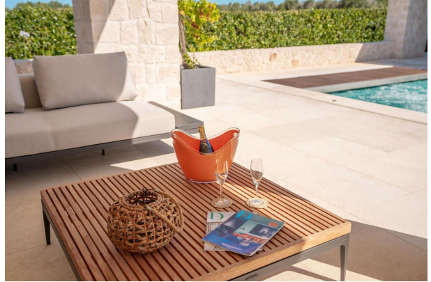
WhatsApp Image 2025-07-17 at 12.41.42 (1)