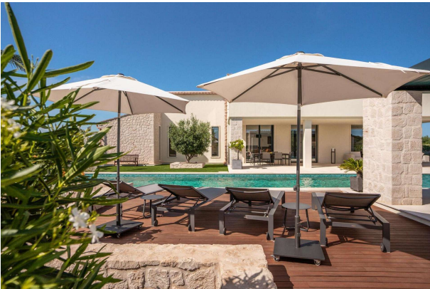
WhatsApp Image 2025-07-17 at 12.41.46 (6)