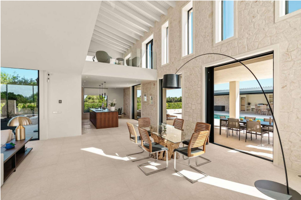
WhatsApp Image 2025-07-17 at 12.41.44 (4)