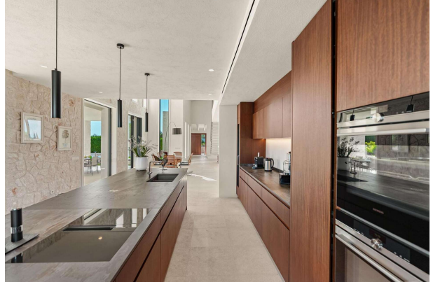
WhatsApp Image 2025-07-17 at 12.41.39 (1)