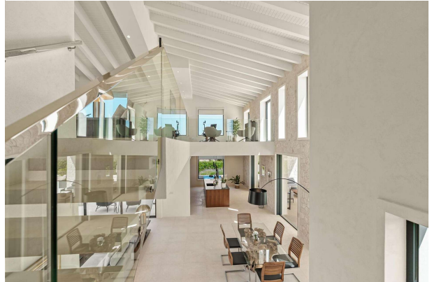
WhatsApp Image 2025-07-17 at 12.41.45 (5)