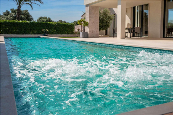
WhatsApp Image 2025-07-17 at 12.41.42 (2)