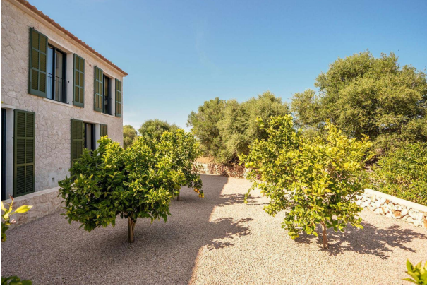
WhatsApp Image 2025-07-17 at 12.41.37 (2)