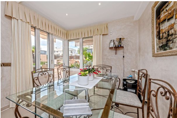
Kitchen dining area