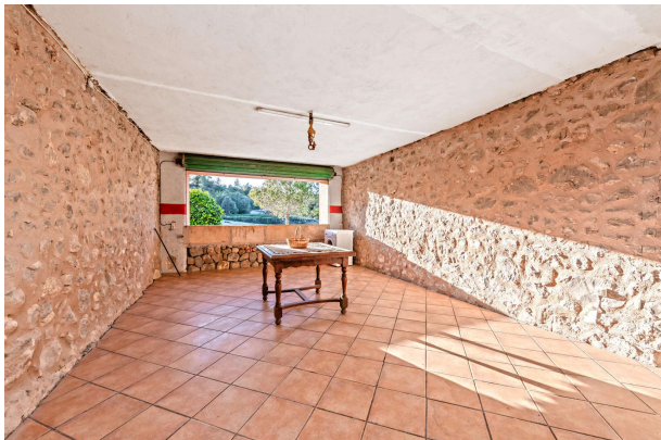
Kitchen ground floor