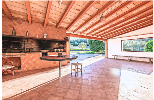
BBQ porch southside