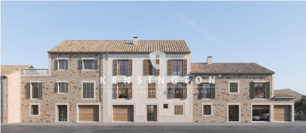
render living area