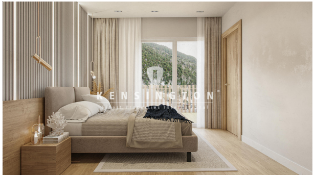
PATIO VISTA ALTA