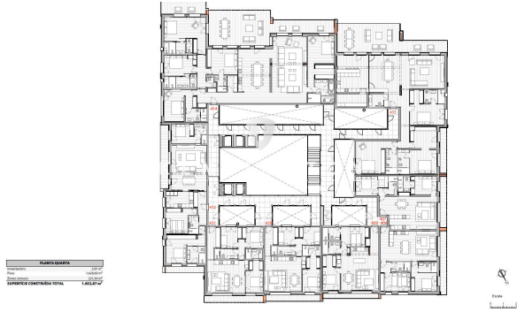
Captura de pantalla 2024-04-11 150951