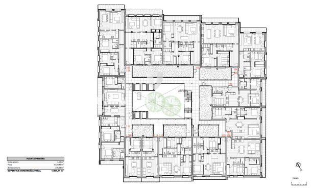
Captura de pantalla 2024-04-11 151012