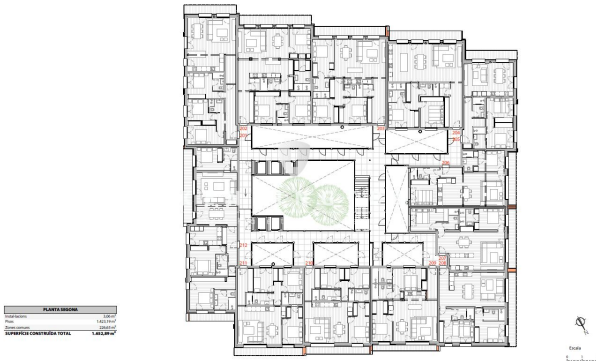
Captura de pantalla 2024-04-11 151033