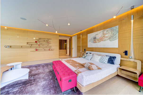
6. Master Bedroom