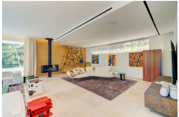
3. Living area