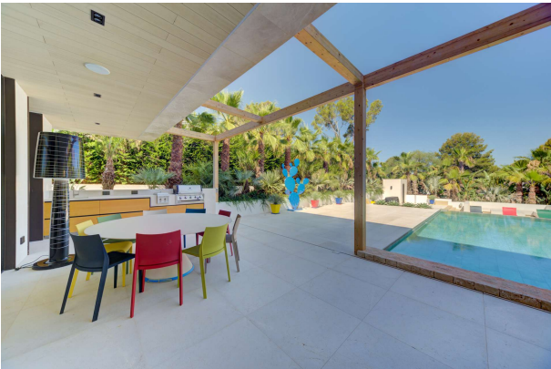
2. Pool area