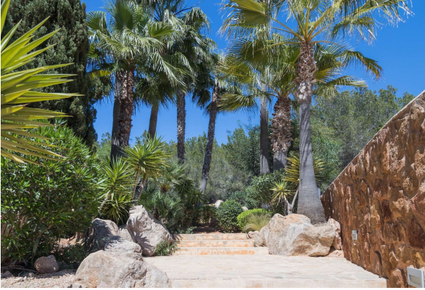
MG 9394 web