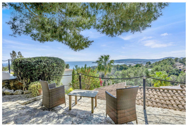
Terrace with sea views