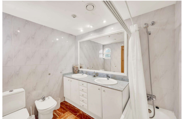
Bathroom in a villa for sale