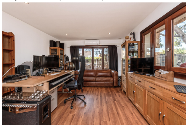
Polyvalent room (music studio)